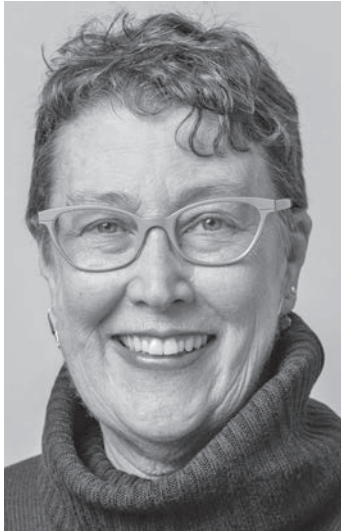
Terrie E. Moffitt

First, we tested whether associations remained across multiple informants of personality. Second, we tested whether parenting only matters when it is extremely adverse, as has been proposed in previous debates of parental influence (Scarr, 1992), by analyzing twins' maltreatment history. Third, we tested whether associations were better explained by "child effects" from child to parent, rather than parenting affecting twins (Ayoub et al., 2018), by adjusting for twins' behavioral and emotional problems at age 5. Fourth, we tested whether associations reflected lasting effects of childhood parenting, rather than the continuity in parenting over the years, by adjusting for received parenting at age 18.