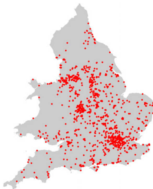
Figure 1 Location of families in the E-Risk study who were living in England and Wales and participated in Phase 12 assessment ( n = 1,071 )

Participants were members of the Environmental Risk (E-Risk) Longitudinal Twin Study, which tracks the development of a nationally representative birth cohort of 2,232 British children (see Figure 1 for the geographical location of families living throughout England and Wales). The sample was drawn from a larger birth register of twins born in England and Wales in 1994–1995 (Trouton, Spinath, & Plomin, 2002). Details about the sample have been reported previously (Moffitt,