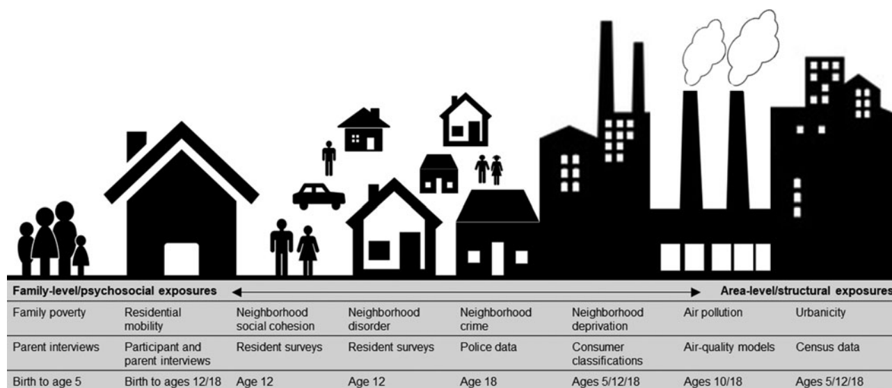
Fig. 1. Illustration of the nature and source of environmental risk variables used in this study.

mothers reported on their own mental health history and the mental health history of their biological mothers, fathers, sisters, brothers, and the twins' biological father (Weissman et al., 2000). This was converted into the proportion of family members with a history of psychiatric disorder (Milne et al., 2008).