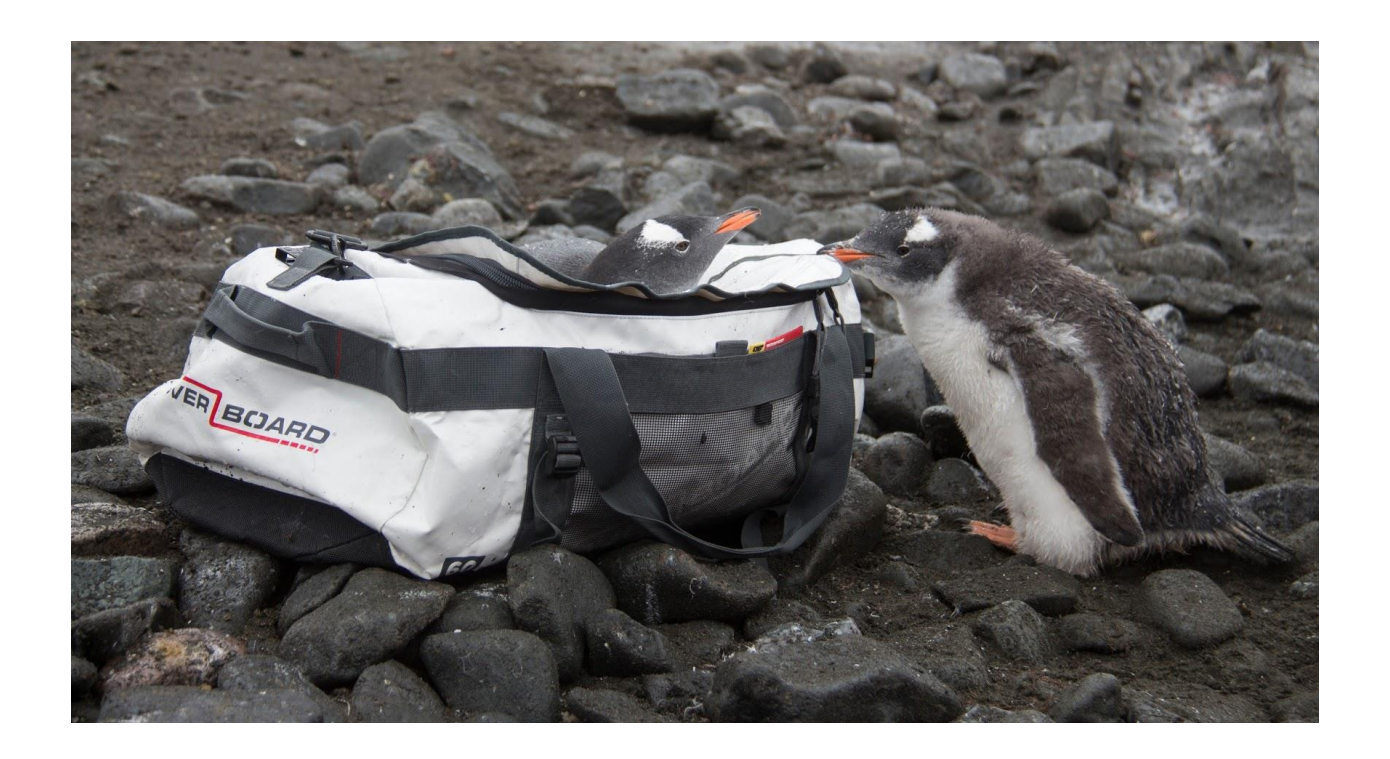
Penguin naps