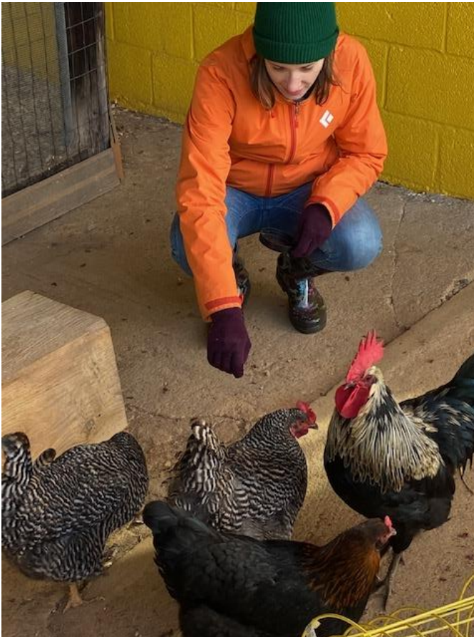
The rooster has green tail feathers,