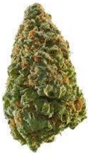
Green widow bud. Thanks, Anonymous.