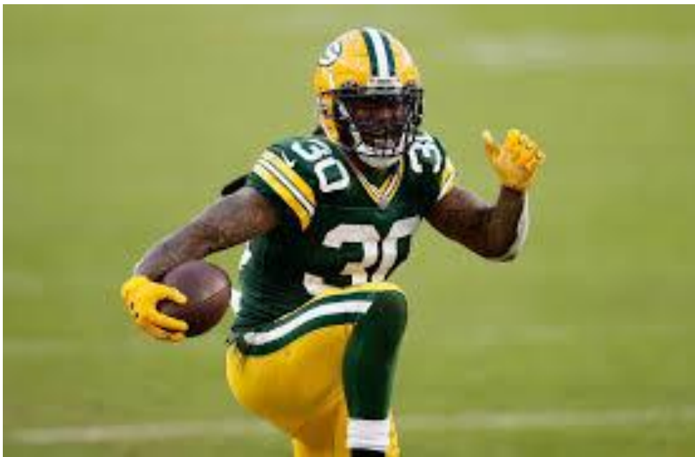
Green Bay Packers, thanks football fan.