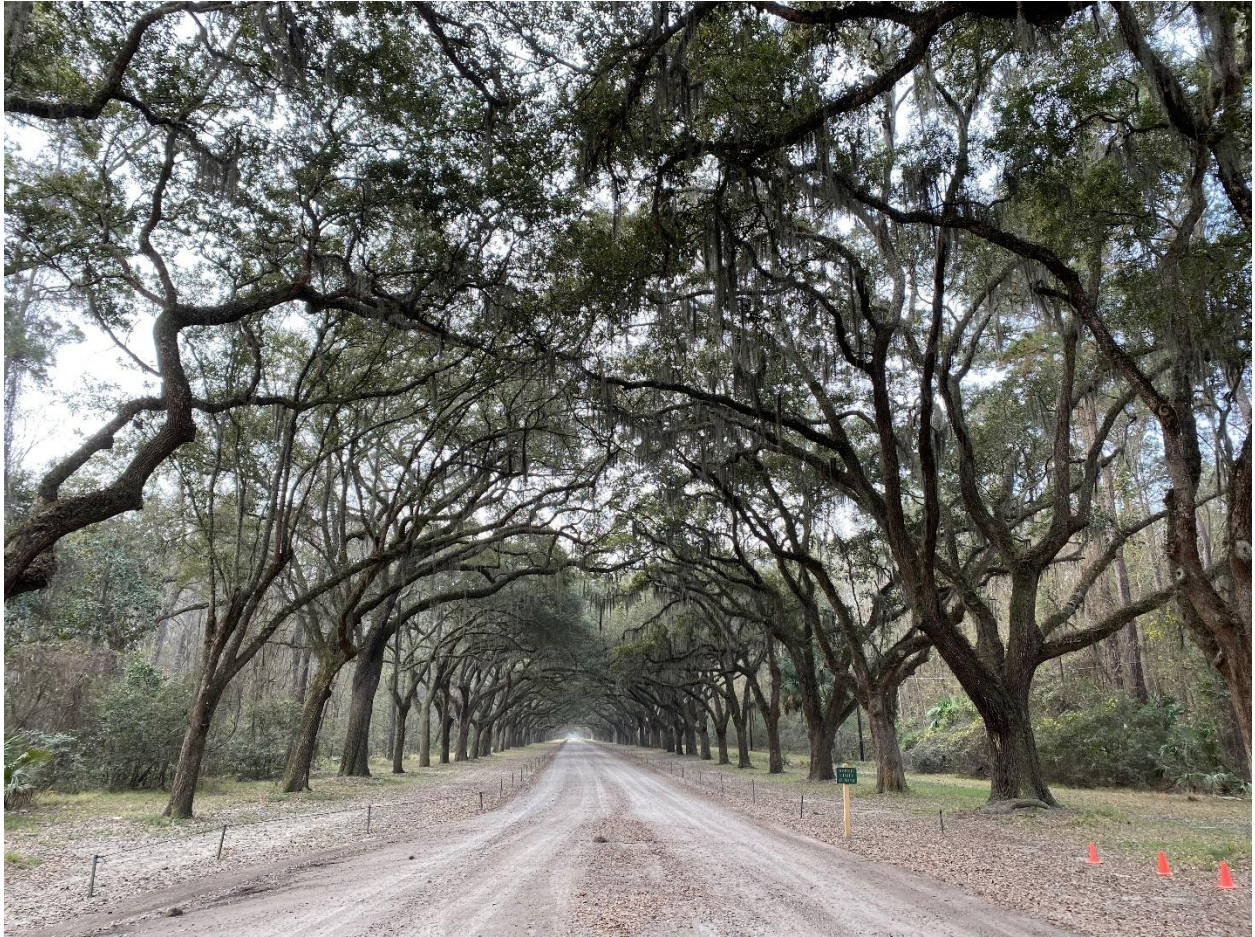
A plantation lane, Savannah, Georgia, March 2021.