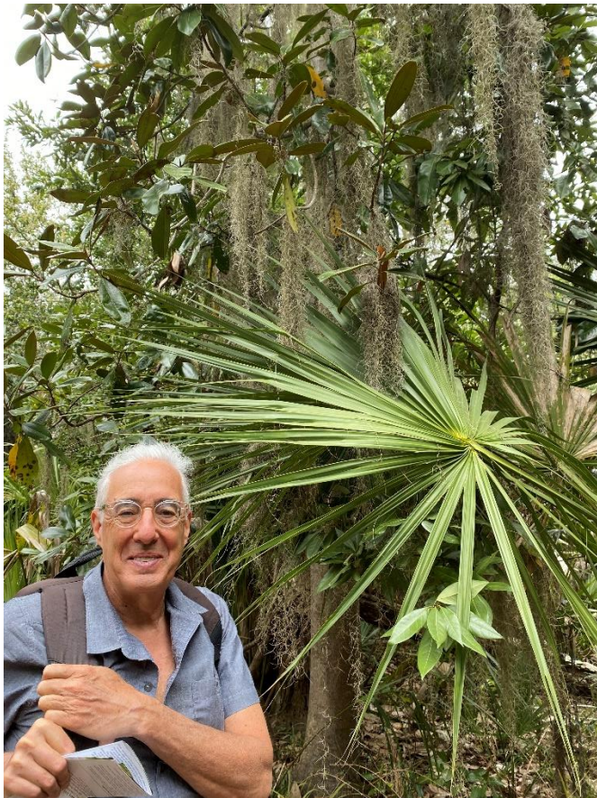
Green palmettos in Georgia.