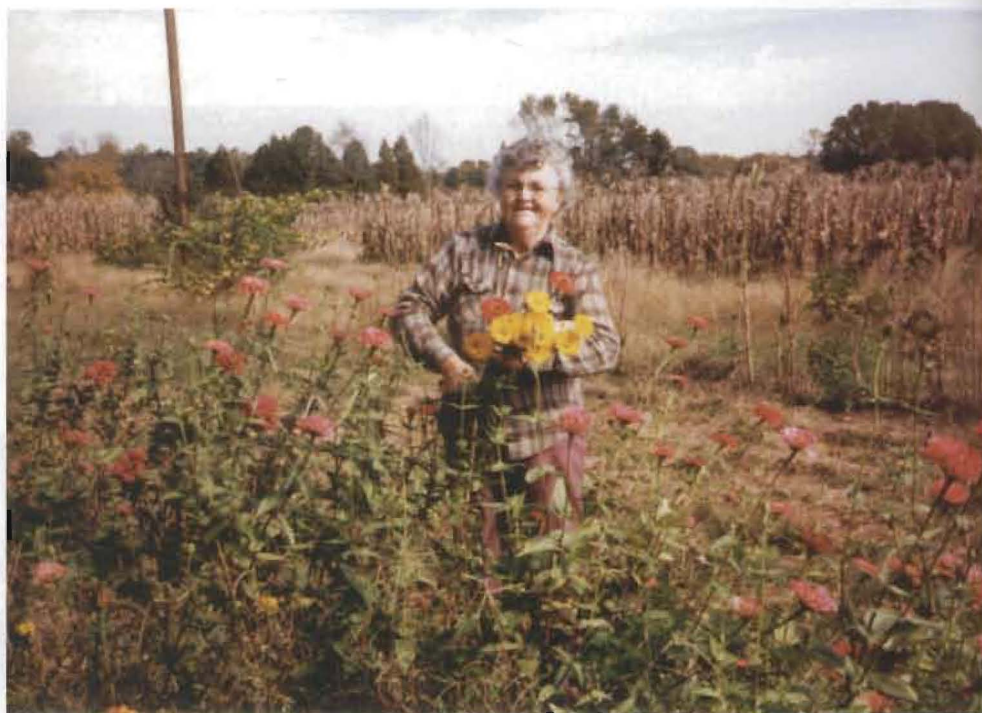
Tending to her flower garden was one of Grandma Macon's daily chores.

From a child's perspective, one of the most important features of that road was that it was studded with white, flint rocks that stubbed our toes if we ran. The road was Grandma's nemesis, too. Granddaddy always hollered at her from one end of the road to "get down here" to the other end, and the garden was always too far down the road to carry hoes and bushel baskets in the humid heat. She had to fight the unending battle against red mud holes, and poison ivy always broke out violently on her arms and neck when she cut the weeds in the ditches. Still, I think she loved and admired her road — years later, when we drove together through